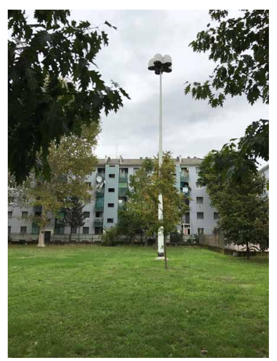
2. View of light-towers to be eliminated

Further indication on lighting: the entire lot has 5 functioning light-towers. The project is supposed to replace the two towers in Perimeter 1 and to replace them with an equally effective lighting system, however it shall be proportionate to a more "urban scale"; the three towers in Perimeter 2 shall be preserved and perhaps enhanced through luminaires placed on shorter light posts. Please refer to the document 3.4 - Plan of subservices .