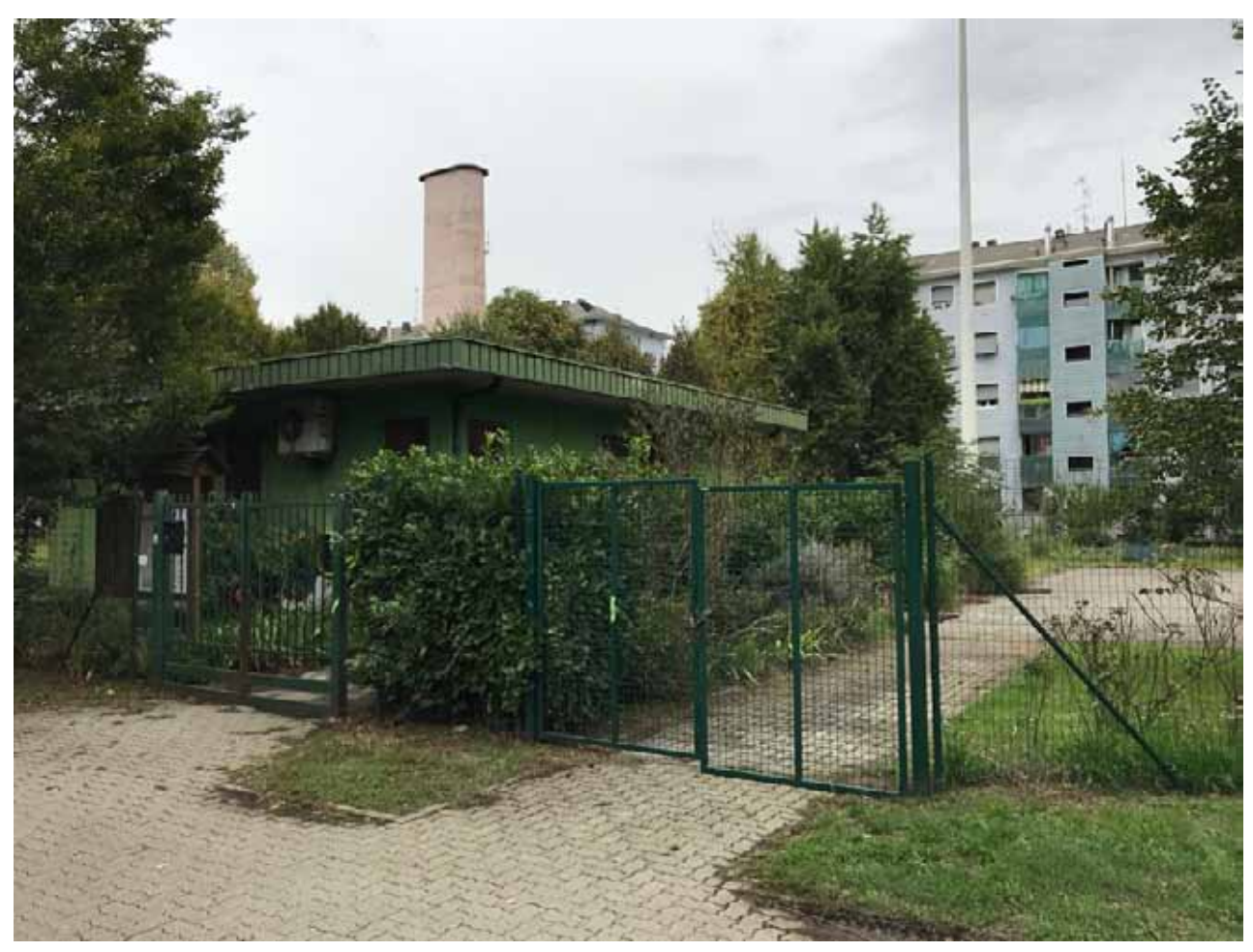
5. View of the "Casetta Verde" that will be knocked down once the New Library will be ready

Please note that the southern border of Perimeter 2 hosts a fountain/ amphitheatre made of stone and brick designed by architect Antonello Vincenti back in the '50s/'60s, whose architectural imprinting strongly marks the area and that shall be preserved.