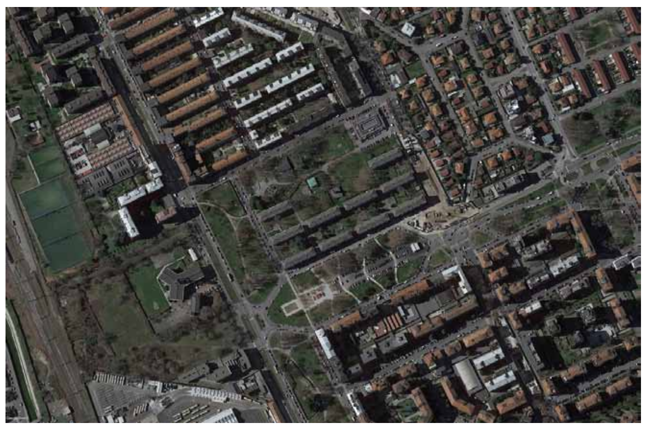
1. View over the area interested by the Competition

The detailed description and all information concerning the urban context where the new intervention will be implemented, shall be found in the Masterplan Programme for Urban and Sustainable Development, Lorenteggio district attached to present Competition. The Masterplan is an integral part of the Programme Agreement.