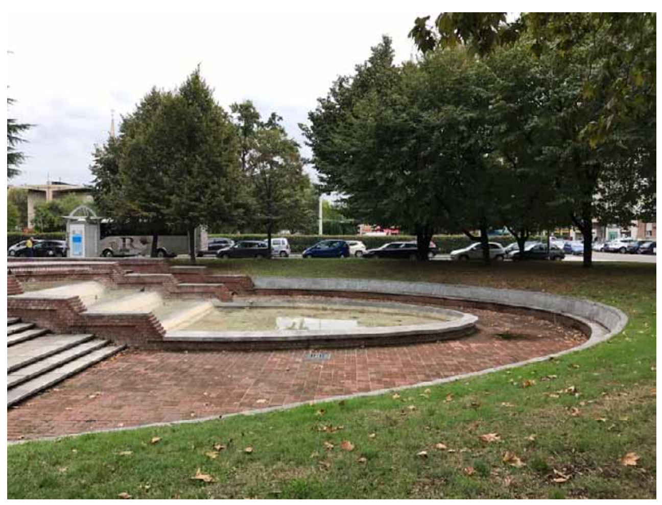
6. View of the fountain/amphitheatre

For assessment on the accessibility of the lot, please note that the area includes working sites of Metro 4 for the implementation of the metro station "Gelsomini", at the crossroad between Via Lorenteggio and Via Primaticcio. This station stands for an added value for the entire district, as well as a pivotal element to reach the New Library from the rest of the City,