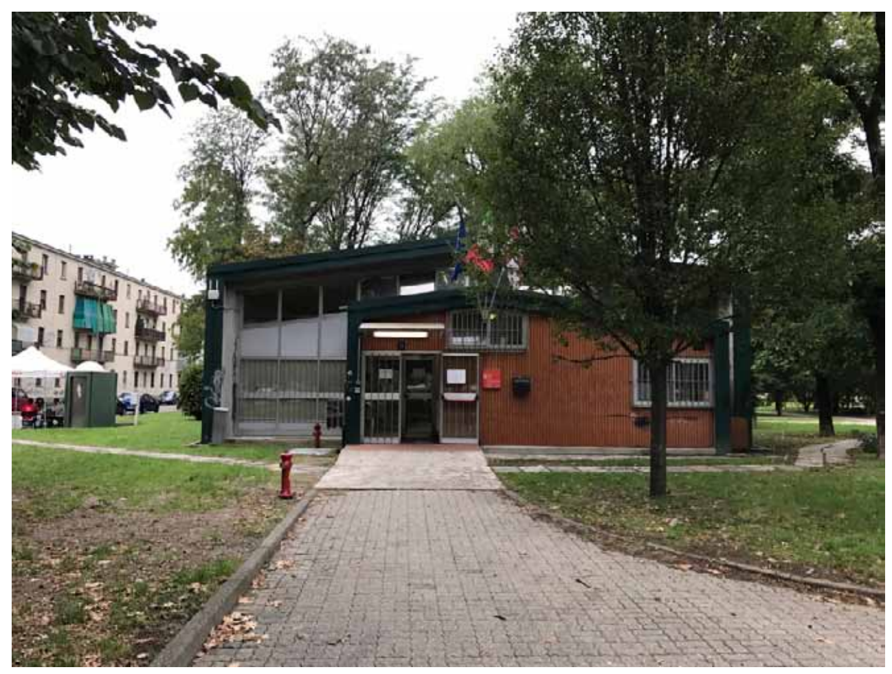
4. View of the front part of the Library - Lorenteggio District

The building, whose furniture has been substituted over time, preserves a similar setting to the original one. Currently, the library is under-sized if compared to the needs and it is not sufficient in terms of the functions and services it should provide.