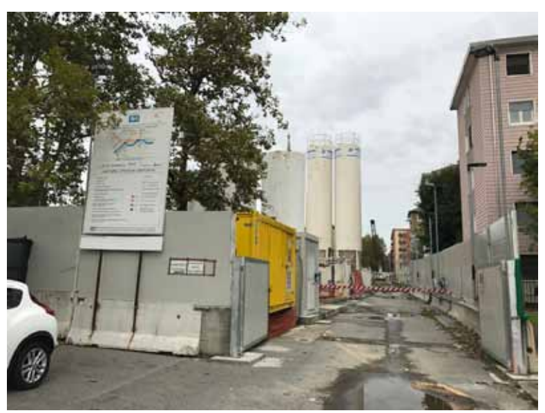
7. View of the working site of the future Station "Gelsomini" - Metro M4

For assessment on the accessibility of the lot, please note that the area includes working sites of Metro 4 for the implementation of the metro station "Gelsomini", at the crossroad between Via Lorenteggio and Via Primaticcio. This station stands for an added value for the entire district, as well as a pivotal element to reach the New Library from the rest of the City,