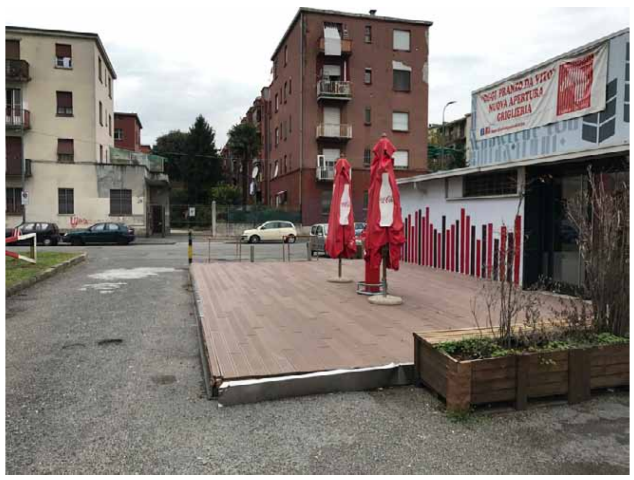
3. View of the raised platform just outside the covered market.

The project shall take into account connections between the New Library and public spaces/buildings, among others, the covered public market that spans outwards through a raised platform, (designed by the Gruppo di Lavoro G124 – Renzo Piano); this platform aims at attaining continuity between the inner commercial space and the outdoor space, thus enhancing the area towards the park.